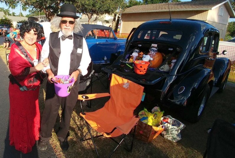
Our invitation to the Halloween party at the Punta Gorda Methodist Church resulted in some of our members wearing their "Sunday go ta meetin' clothes".