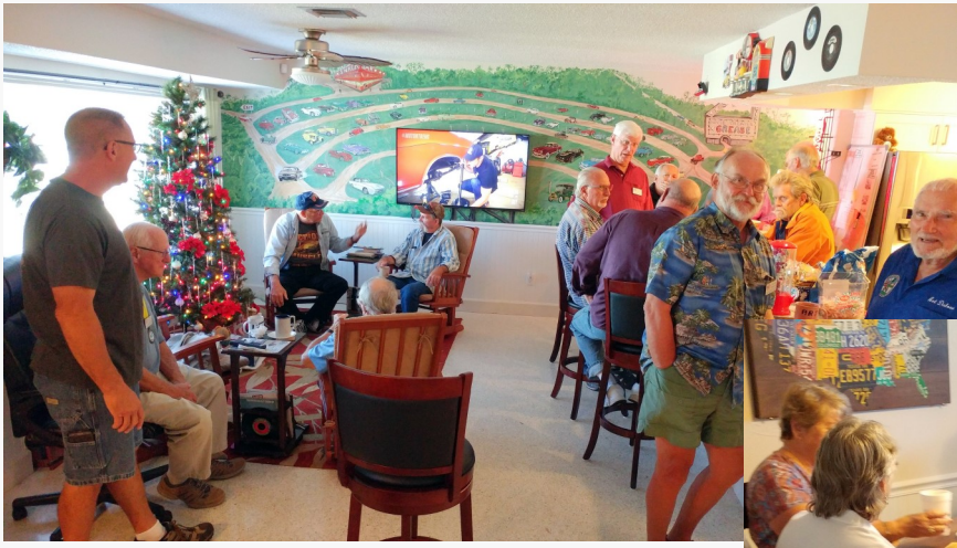
After a cool fall up north it was great to break out the short pants and share memories at our club house. Except for that day when it got below 80 degrees and everyone broke out their winter coats.