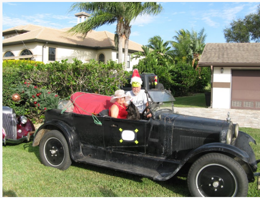
Everyone enjoyed the Witt's "Grinch Mobile" (below) during the Rotunda parade.