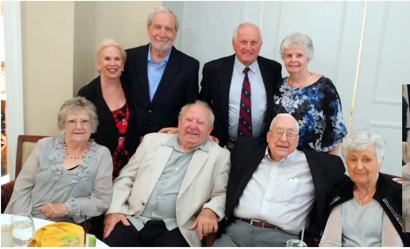
Our poker group, "Just Cruzin" makes for a handsome group!