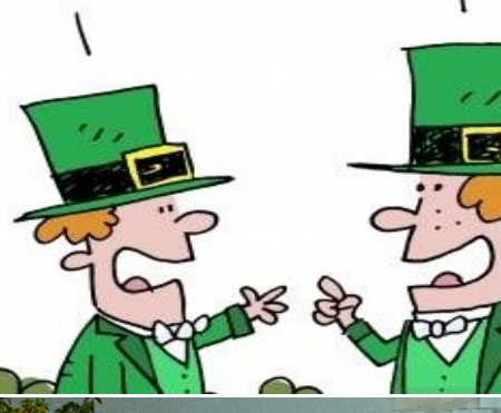
Alcohol is a great preservative!

Another Year older and you look young as ever!