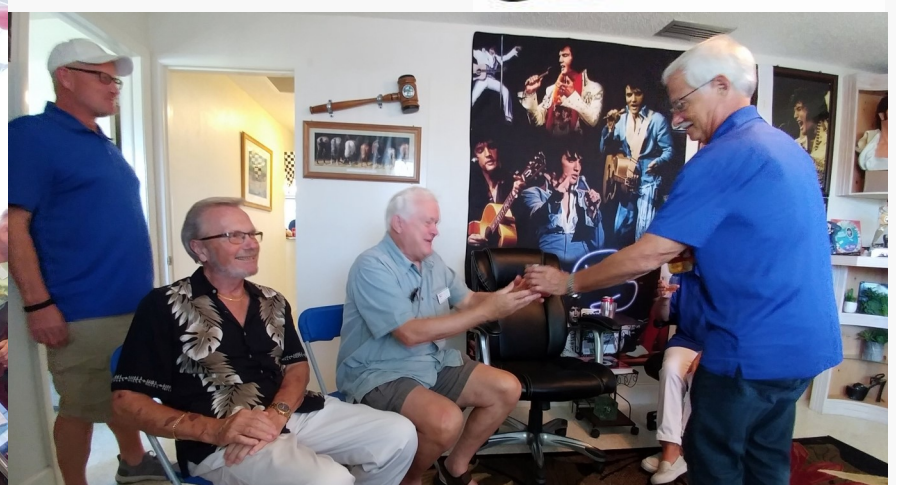
Classic Car or Harley trikes, when PRCC has a party everyone shows up!