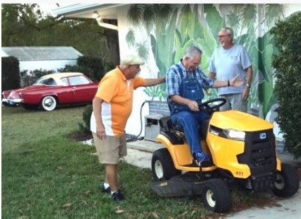
"City Boy" Craig thought just because he had on farmer's bibs that he knew how to start a lawn mower!