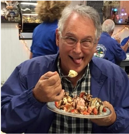
Our Grand Poobah shows how it's done at Zoet's Ice Cream Shop