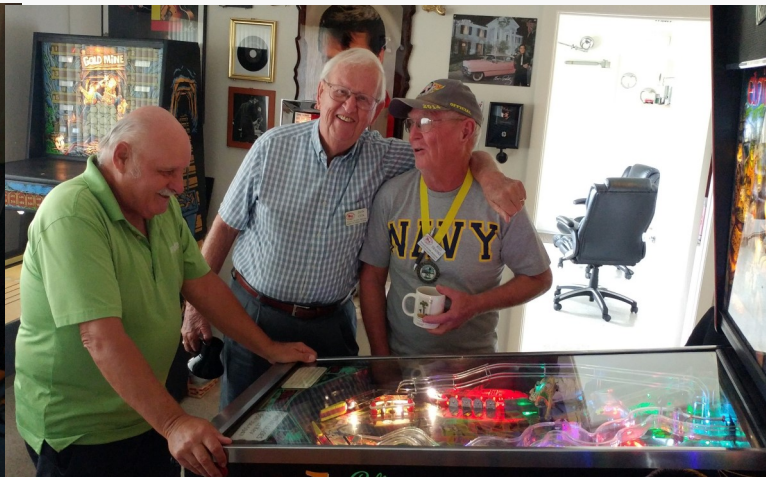
The clubhouse is open and ready to enjoy! With the addition of a slot machine, 2 pinball machines and a bowling game it should keep everyone happy!