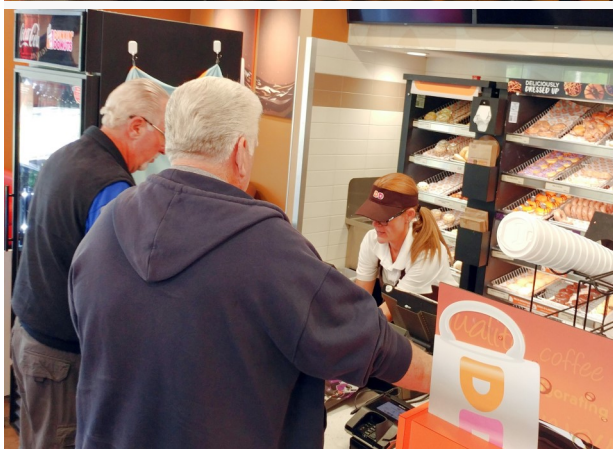
The annual car show and auction at Lee Civic Center was rained out. However, that did not stop our crew from enjoying the trip, or should I say food?