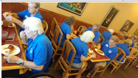
Good food and good friends at Luigi's!